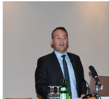
Peter Friedrich, Baden- Württemberg Minister for European Affairs