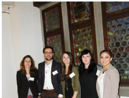
Our team of student assistants