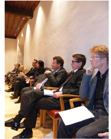
Invited speakers (Major of Konstanz, Vice Rector of Uni Konstanz, Foundation representatives, etc.)