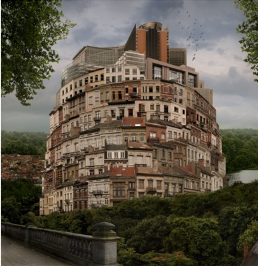
Eric de Ville The Tower of Brussels (2010)