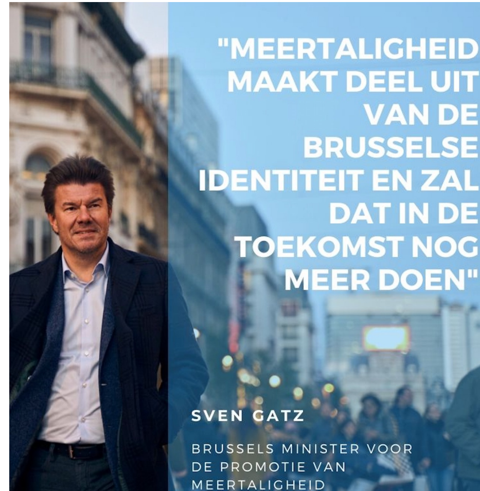
Brussels Minister for the Promotion of Multilingualism 2019