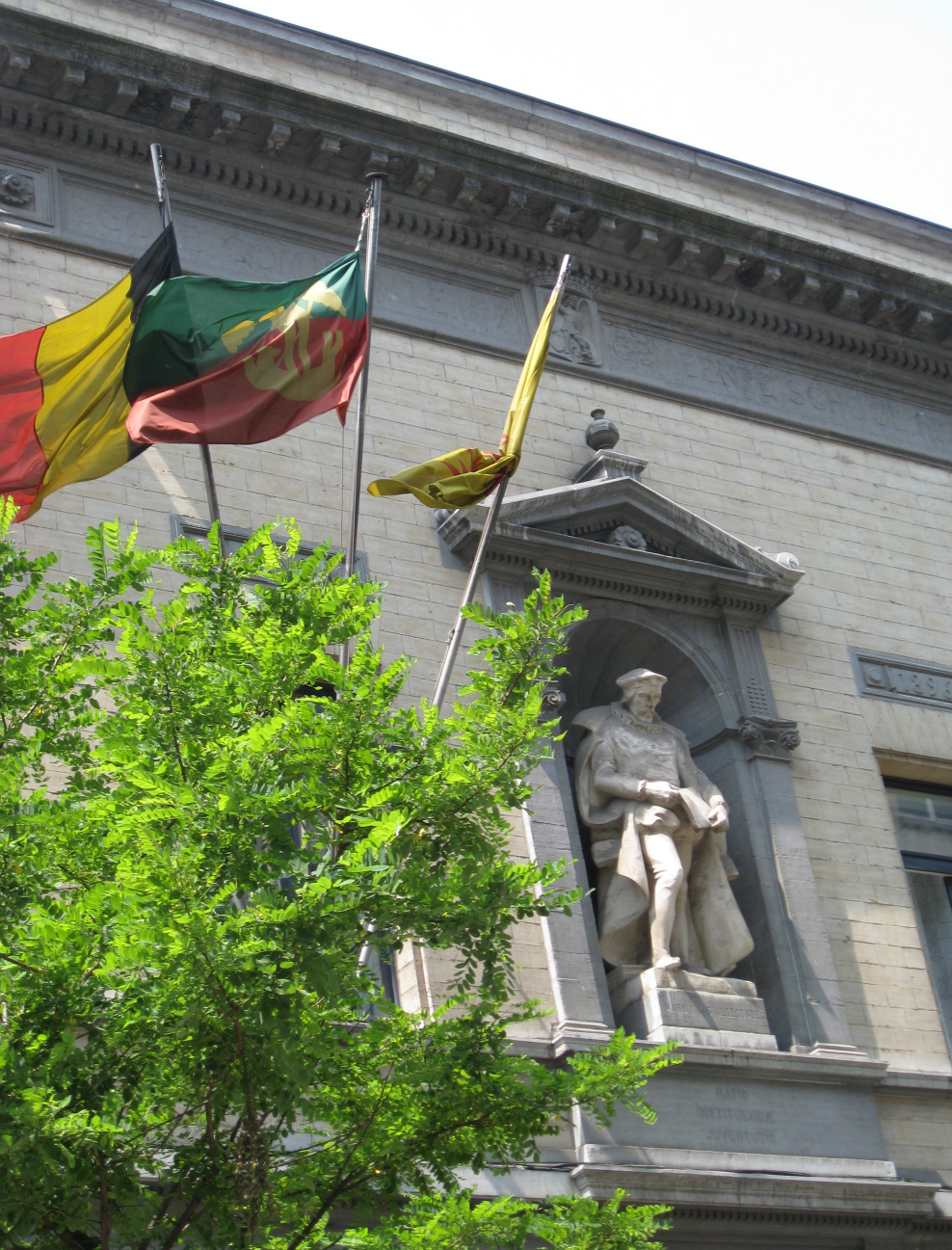
The Marnix Plan for a Multilingual Brussels 2013